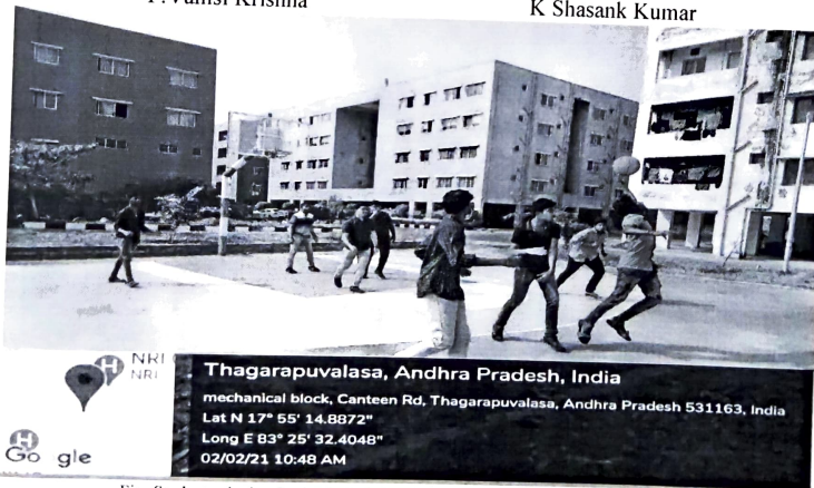
Fig: Students playing Basket ball during their orientation program on 02-02-2021