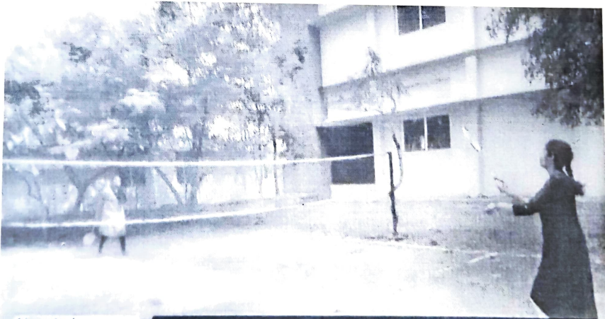
Fig: Students playing Badminton during their orientation program on 02-02-2021