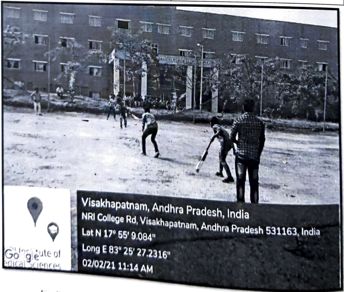
Fig. Students playing Cricket during their orientation program on 02-02-2021