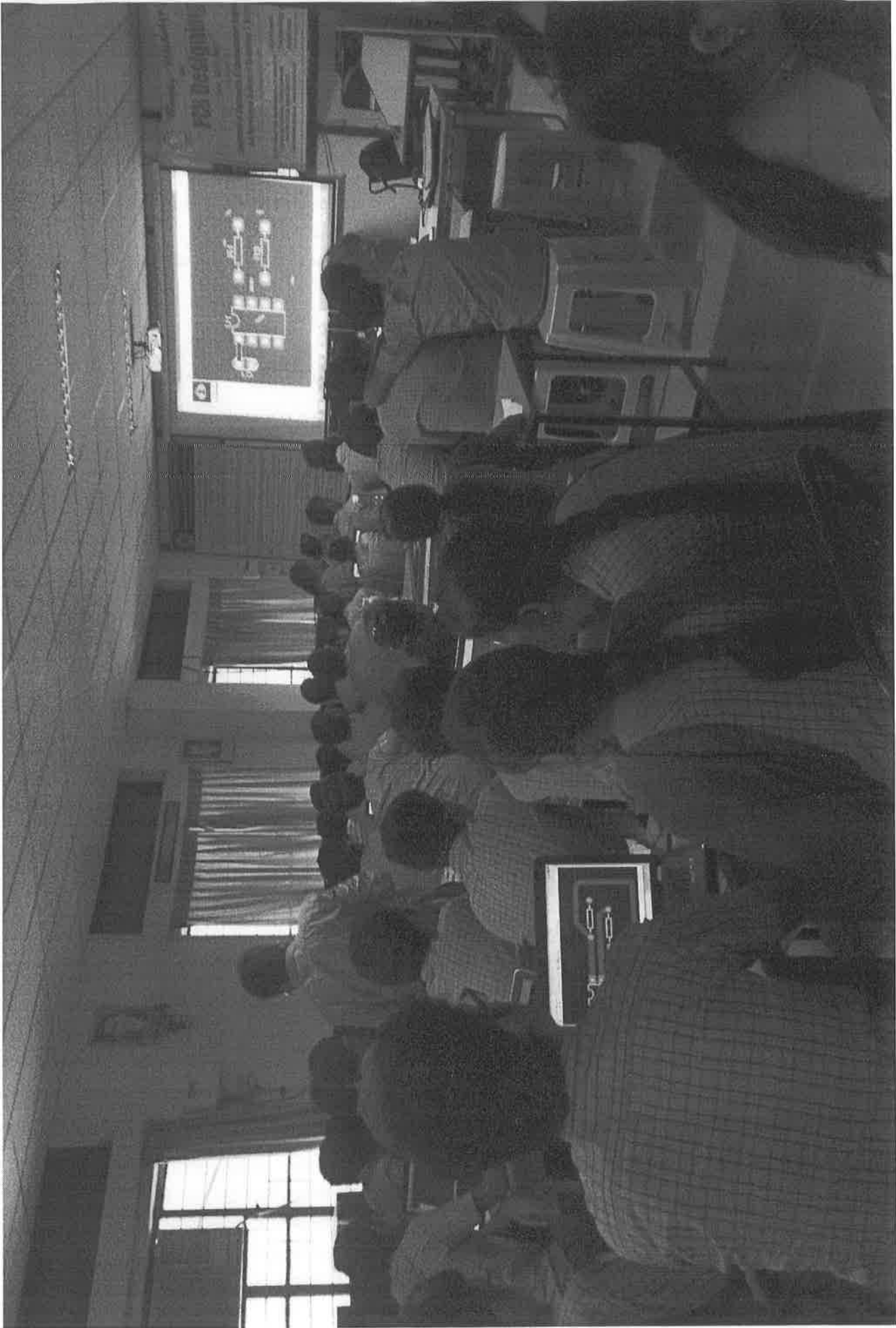
Layout Preparation of Circuit